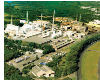
Rodovia BA 099, km 20, Abrantes Camaçari, BA. CEP 42.829-710 Brazil